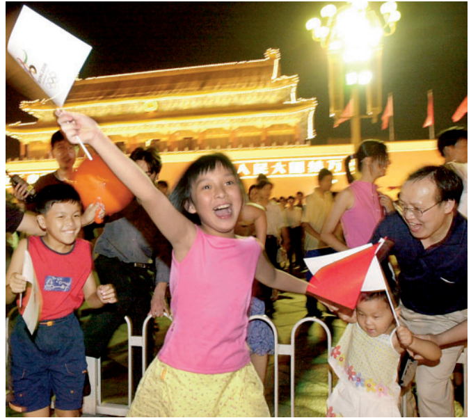
▲ People celebrate in Tiananmen Square after Beijing won the bid for the 2008 Olympic Games.

People in China and around the world have a desire for more political freedom. As economic and social conditions improve—for example, as the middle class expands and educational opportunities grow—the prospects for democracy also may improve. In addition, as countries are increasingly linked through technology and trade, they will have more opportunity to influence each other politically. In 2000, for example, the U.S. Congress voted to normalize trade with China. Supporters of such a move argue that the best way to prompt political change in China is through greater engagement rather than isolation. Another sign of China’s increasing engagement with the world is its successful campaign to host the 2008 Summer Olympics in Beijing.