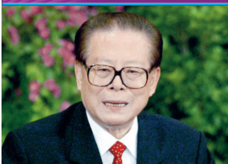
Jiang Zemin 1926–

Jiang Zemin was trained as an engineer. After working as an engineer, heading several technological institutes, and serving as minister of the electronics industry, he moved up in politics.