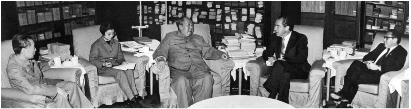
▲ Zhou Enlai, a translator, Mao Zedong, President Nixon, and Henry Kissinger meet in Beijing in 1972.

Instead of saving radical communism, however, the Cultural Revolution turned many people against it. In the early 1970s, China entered another moderate period under Zhou Enlai (joh ehn•ly). Zhou had been premier since 1949. During the Cultural Revolution, he had tried to restrain the radicals. A